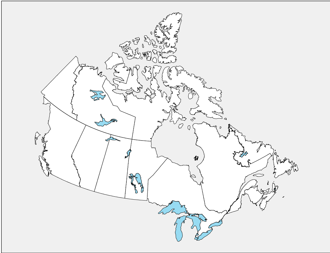
Figure 3 The province/territory boundary layer

The province/territory boundary layer consists of polygons classified as being part of the landmass or as water. Polygons representing every province/territory are included in this file. Each province/territory polygon contains its unique identification code (the PRuid) and name as an attribute. This boundary layer is provided solely for mapping the boundaries of the provinces and territories in a map of the agricultural ecumene.