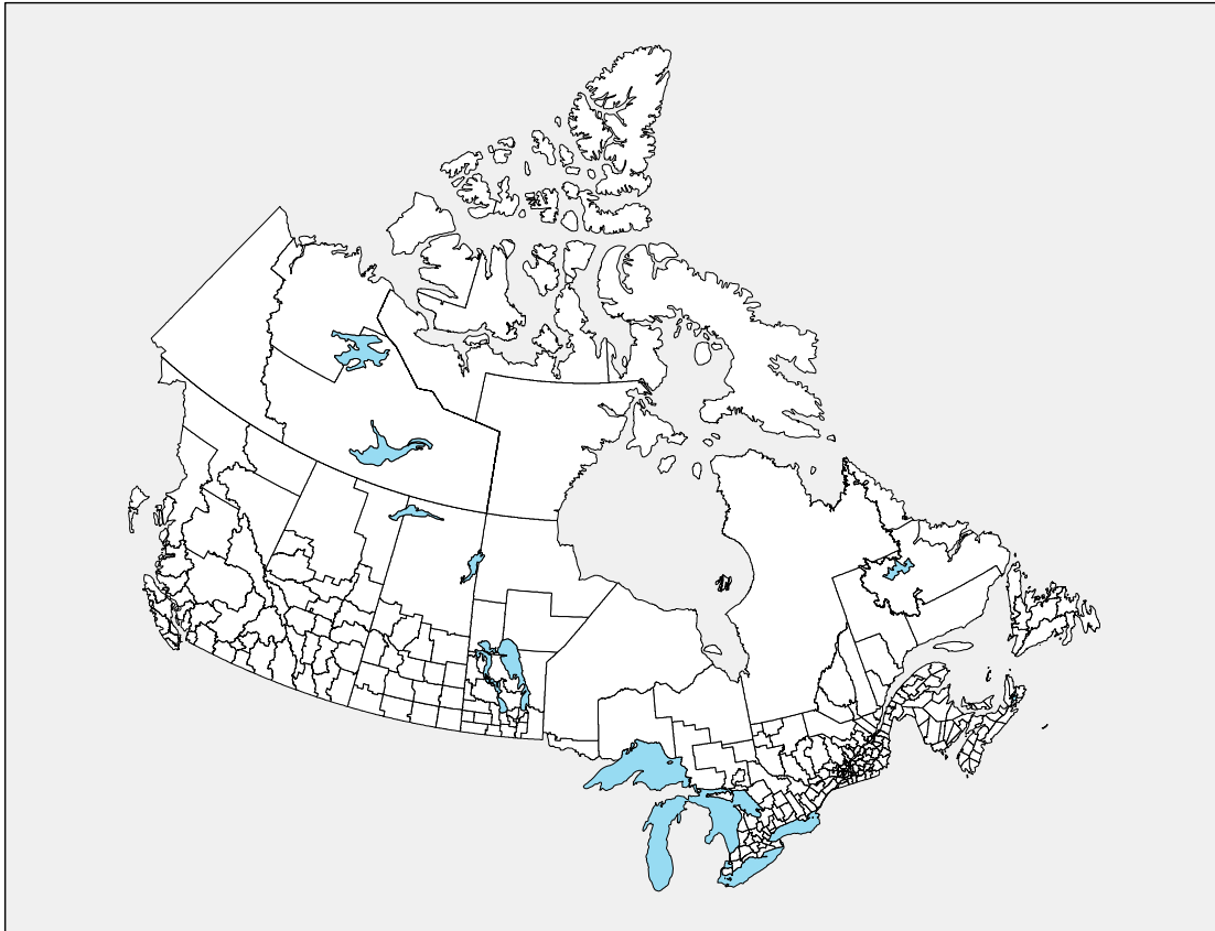
Figure 2 The census division boundary layer

The census division boundary layer consists of polygons classified as being part of the landmass or as water. Polygons representing every census division are included in this file. Each census division polygon contains its unique identification code (the CDuid) and name as an attribute. This layer is provided solely for mapping the boundaries of the census divisions in a map of the agricultural ecumene.